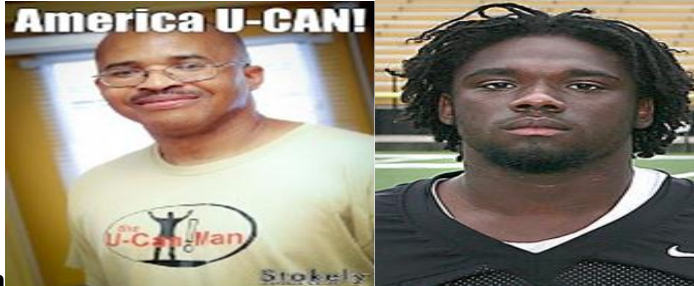
The U-Can! Man