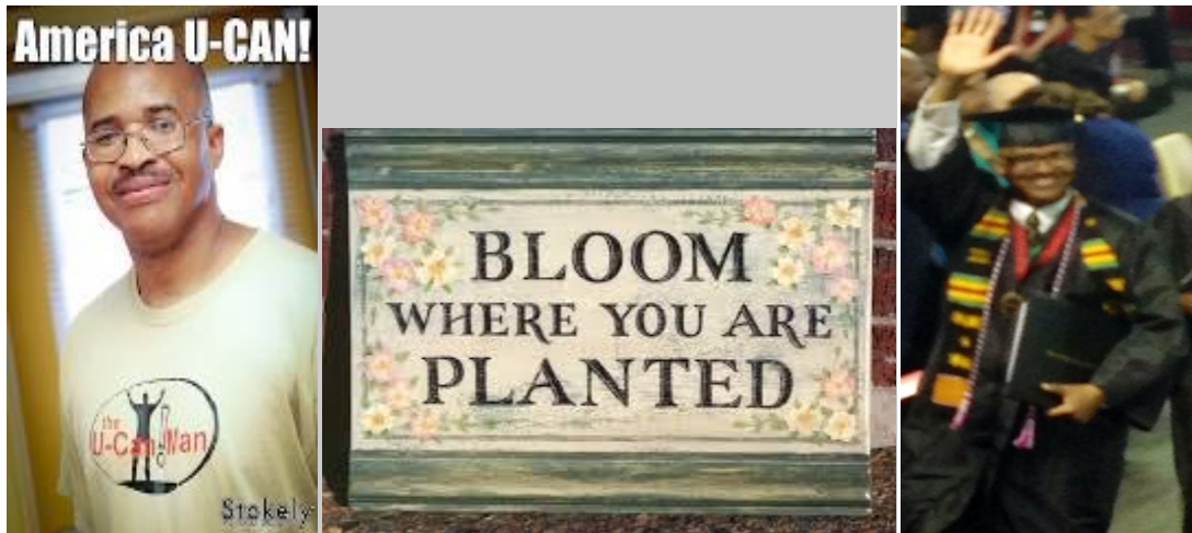
The US Army Veterans Affairs Planted Me In College July 2009-2013 I have Bloomed Where I Was Planted

1978-82 High School Jefferson County High School, Monticello FL Results 2.07 GPA Earned 1 A (97) In 10 grade PE 1982-2007 United States Army Results Was Fearful Of Attending College July 2009 Compass Test Valdosta State University Testing Center Test Results Math 16 needed 37, Reading 33 Needed 61 English 53 Needed 61 Fall 2009 Remedial Courses South Georgia State Entry Level Program Test Results (Passed Regents Essay and Reading 1 st Test) 2010: Foundation 4.0 GPA Freshman Year South Georgia State Entry Level Program 2011: Decreased 3.46 GPA Sophomore Year Valdosta State University 2012: Increased 3.49 GPA Junior Year Valdosta State University 2013: Increased 3.60 GPA Senior Year Valdosta State University Deans list last 4 Consecutive Semesters: Spring 2012, Fall 2012, Spring 2013, Fall 2013