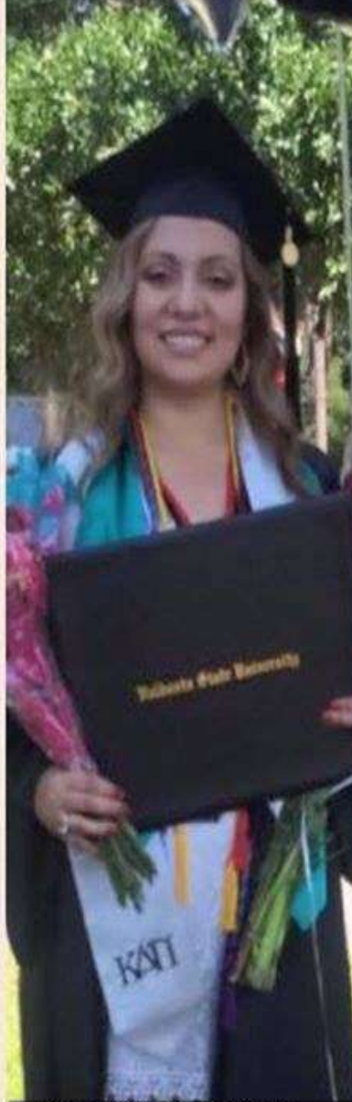
CLASS OF 2015