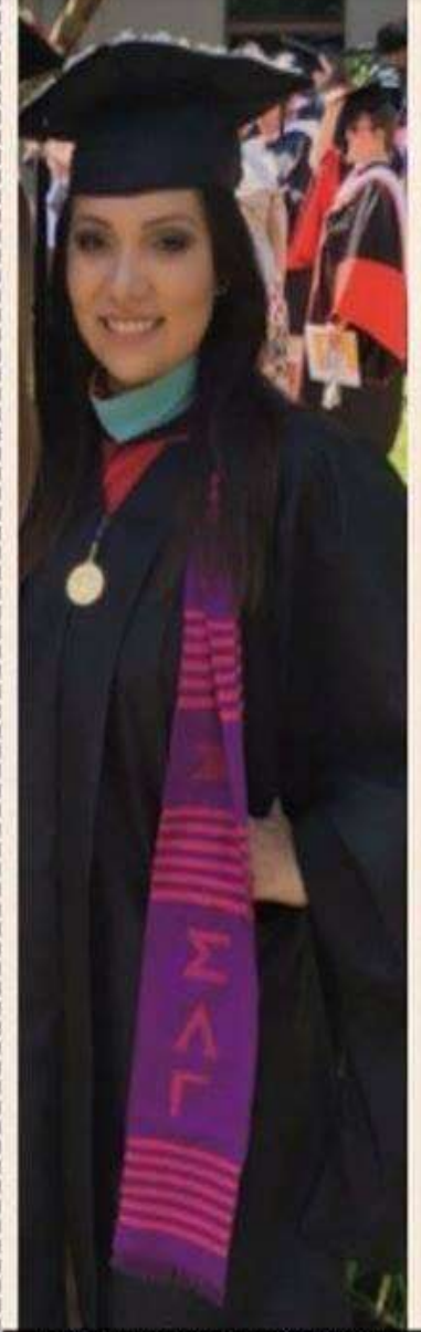
CLASS OF 2016